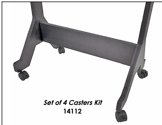
Set of 4 Casters Kit 14112

STEP 3: Carefully tilt your Floor Standing Barrier back up straight until all 4 casters are firmly seated on flat surface. Re-install Divider Panel into Leg assembly of Floor Standing Barrier.