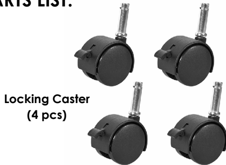
Locking Caster (4 pcs)

Add-On Kit to be used with Adjustable Height Floor Standing Barriers